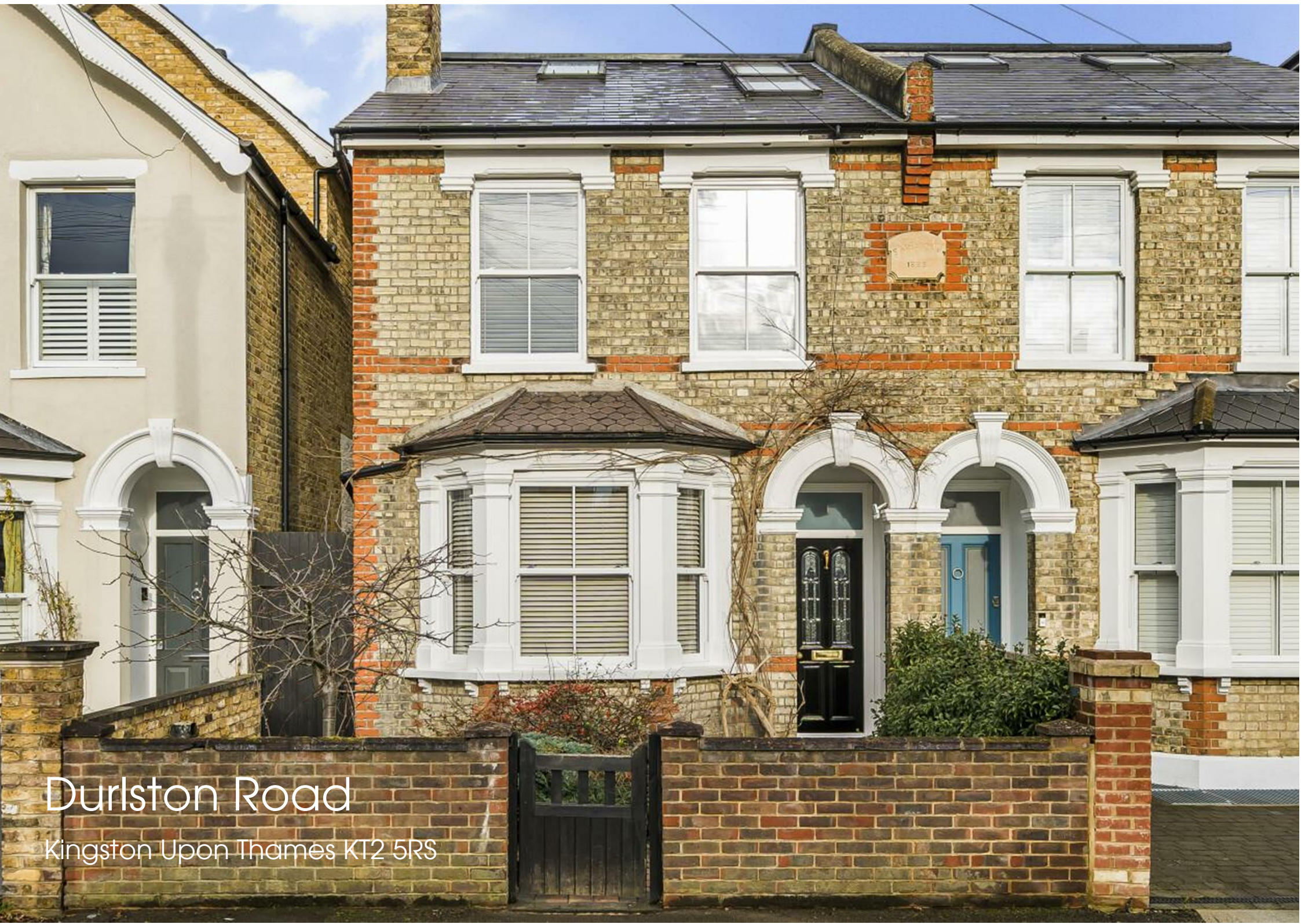
Durlston Road Kingston Upon Thames KT2 5RS